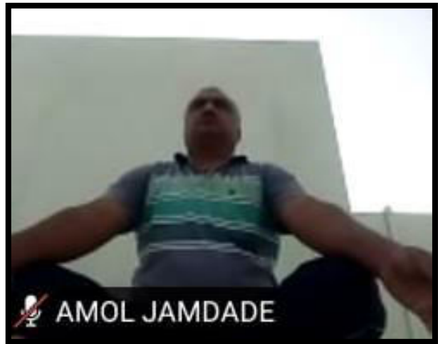
College staff doing Yoga activities in an Online Workshop.