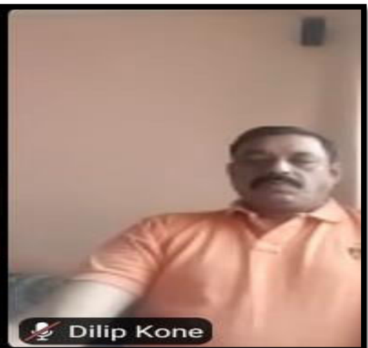
College staff and Students doing Yoga activities in an Online Workshop.

Company Commander Dr. Patangrao Kadam Mahavidyalaya, Ramanandnagar (Burli)